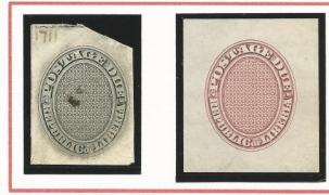
Die Proof #1711. Thick Paper (.0043 in.) Engraved by Bain. Given out 16-11-93.

Only two small black die proofs were made, one for reference and one as the printer's working set. The small black die proof above is from the printer's working set, damaged by water in WW2.