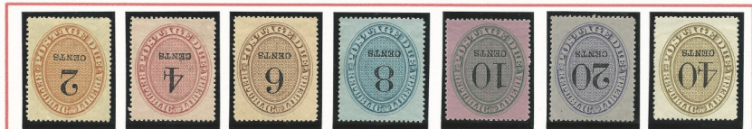
2c ex-Cunliffe Inverted, Perf 15, Gummed. 4c-40c ex-Shoemaker