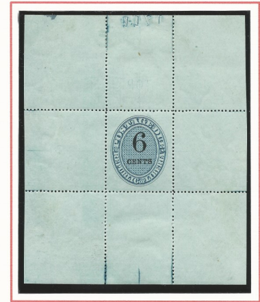
Die Proof Color Trial. Perf 15, Gummed. Embossed 1711 on reverse.

Postage Due inverts are rare. Only one stamp is known of the 2c invert, making this the only documented complete set.