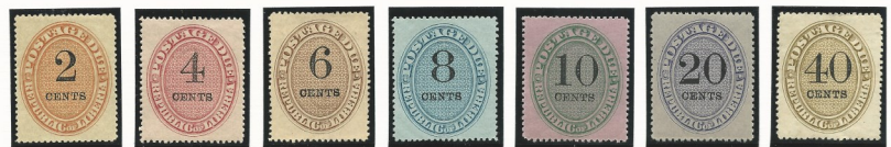
Issued Stamps, Perf 15, Gummed.