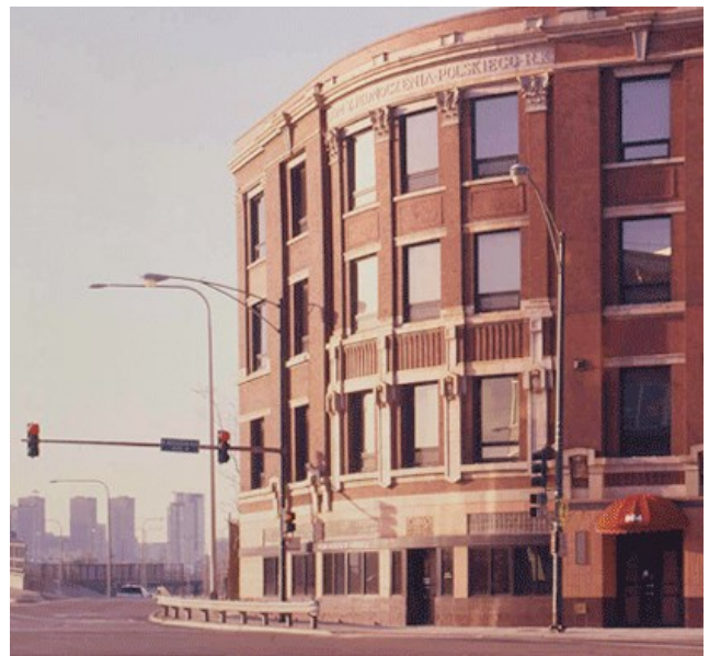
Polish Museum of America.