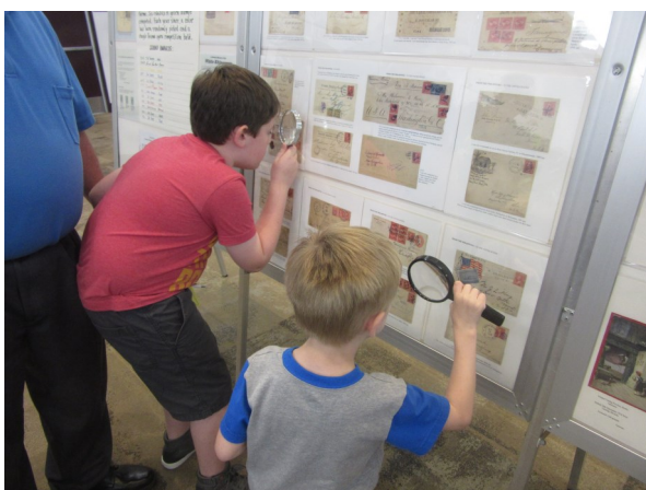
Two young collectors demonstrate good philatelic form, using their magnifying glasses to examine covers in the exhibit from Labron Harris.