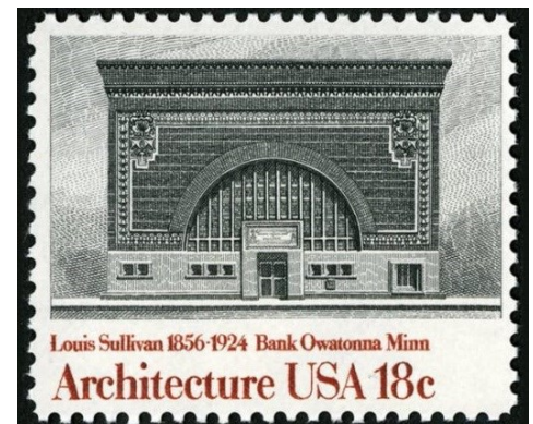
The Owatonna Bank Building depicted on Scott 1931.