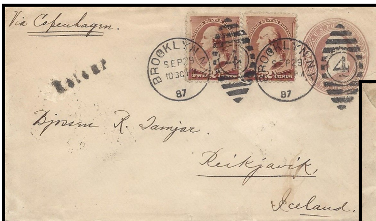
Front of this cover a posting from Brooklyn to Iceland on September 29, 1887.

A couple of notations on the reverse of the cover are informative. Three previous auctions notes are helpful in tracing the provenance of the cover as well as a pencil marking indicating the entire is 1 of 2 known (covers to Iceland).