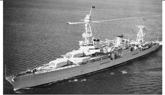
Figure 1. The USS Houston .

other USS Houston as long as American ideals are in jeopardy."