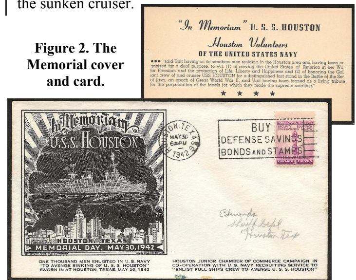
Figure 2. The Memorial cover and card.

Within three months of the Houston's demise, they had succeeded. Here's an "In Memoriam" cover commemorating that quite amazing feat, with a cachet by the well known World War II cachet artist Tex Edmunds. The cover contained a card containing a portion of the citation presented to each of the new enlistees, a citation honoring the "gallant crew" of the sunken cruiser.