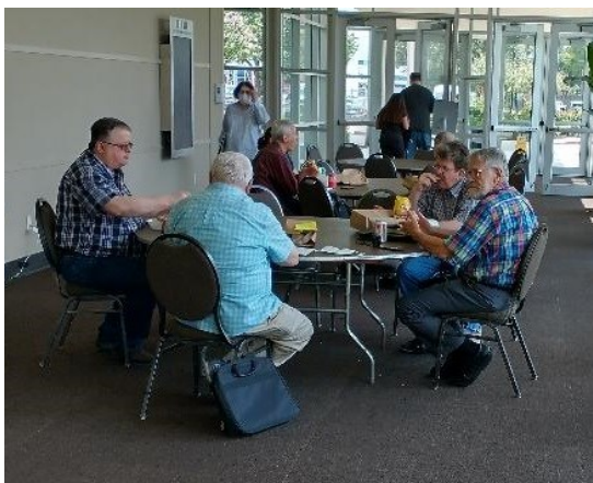
Visitors enjoying lunch at the GHSS